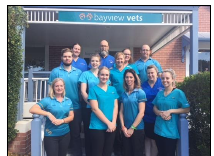
Our Bayview Family Portrait