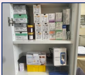
Wide range of suture materials